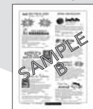
Promotion Page 4

ALL ARTWORK MUST BE SUBMITTED BY September 15, 2010.