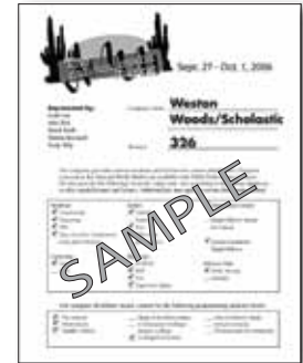
Sample Tab Page

Please complete the electronic Tab Page Form supplied using Acrobat Reader. Please email to martin@softpack.com. This page will be designed by NMM. The back of this page will be blank.