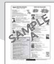
Promotion Page 3