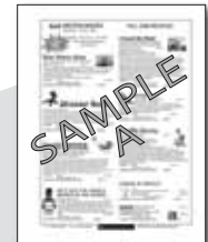
Promotion Page 1